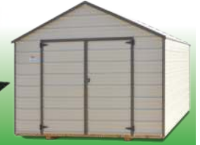
Best Value Metal