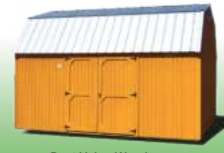
Best Value Wood Side Lofted Barn